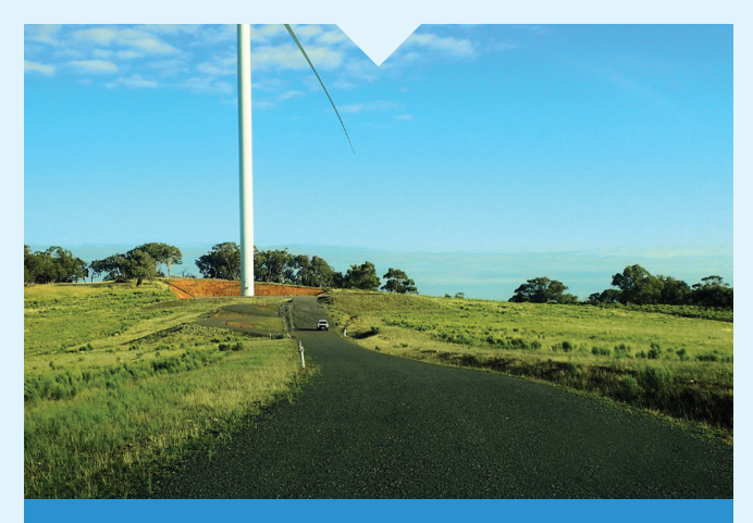
Same location after rehabilitation – January 2022