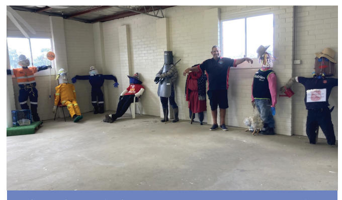
Cedric and Topsy (with an Emergency Services scarecrow) at the 2022 Boorowa Show

Using donated and recycled materials, "Cedric" was on show alongside a 3-metre high "Topsy Turbo" wind turbine, looking the part in his hi-vis work wear. Cedric and Topsy attracted quite some interest.