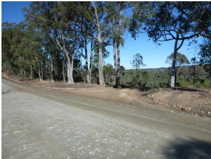
Plate 26 Location of PB18 ; looking 180°.

This site is on the LHS of the road on a saddle of a gently undulating ridge crest (Plate 26). The site is an existing area of cleared batter and graded gutter area measuring c. 20 x 8 m; it is highly disturbed. The site would require some levelling.