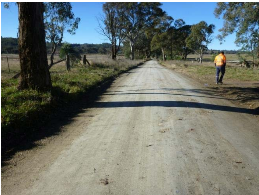
Plate 60 Location of PB41 ; looking 20°.

This site is on either the LHS or RHS of the road on a flat (Plate 60). The site is an existing cleared and graded area; both sides of the road are highly disturbed. Some levelling may be required.