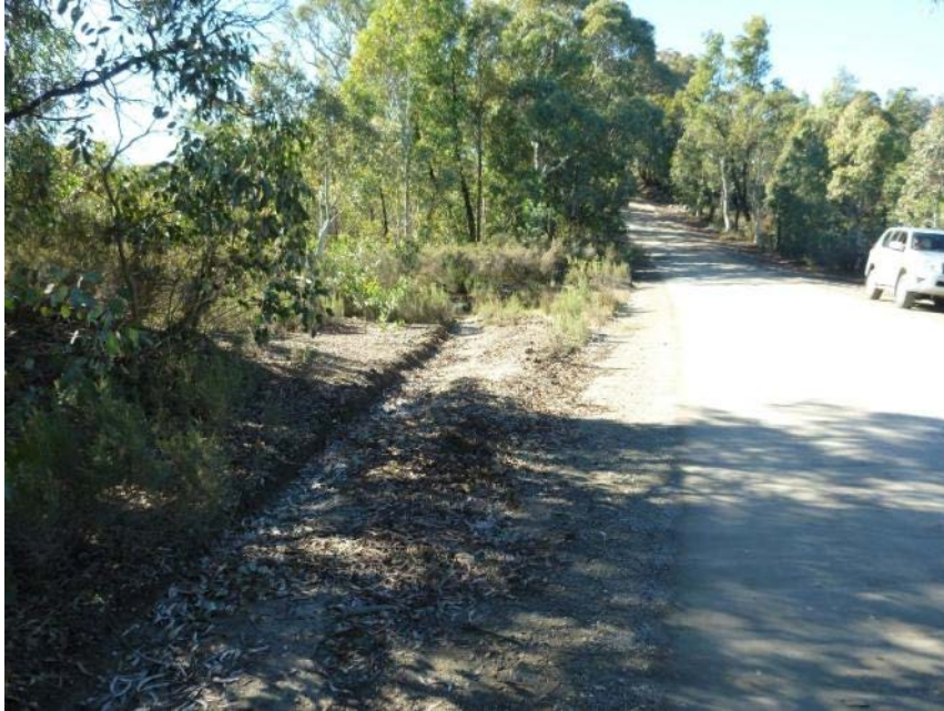
Plate 29 Location of PB20 ; looking 30°.

This site is on the RHS of the road on a slight saddle of a very gently undulating ridge crest (Plate 29). The site is an existing area of cleared batter and graded gutter area measuring c. 20 x 5 m; it is highly disturbed. The site would require some clearance and levelling.