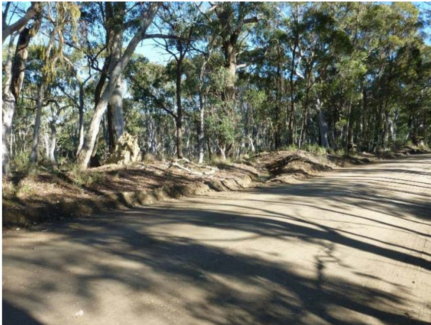
Plate 50 Location of PB34 ; looking 200°.

This site is on the LHS of the road on a very gently undulating ridge crest (Plate 50). The site is an existing cleared and graded area measuring c. 30 x 4 m; it is highly disturbed. Minor clearing and levelling would be required.