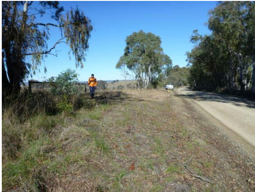
Plate 17 Location of PB13 ; looking 170°.

This site is on the LHS of the road on a narrow, very gently undulating ridge crest (Plate 17). The site is an existing area of clearing and graded farm entrance measuring c. 30 x 5 m; it is highly disturbed. The site would require some clearing and levelling.