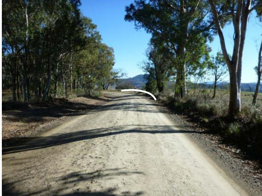
Plate 8 Location of Upgrade 3.5 ; looking 300°.

At this site it is proposed to fill and level on the RHS corner (Plates 8 and 9). The site is on a very gently undulating ridge crest. The area in which impacts would occur is highly disturbed by previous road works and the formation of a farm entrance. The majority of impacts would occur on an existing deeply excavated gutter, therefore previous impacts are high. The farm entrance at this site is also the location of proposed PB07 .