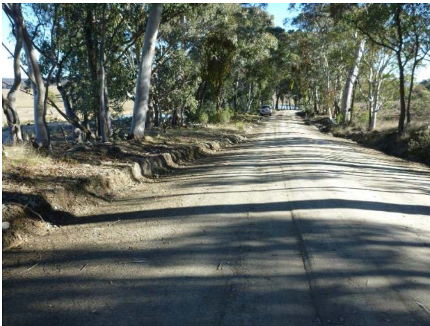
Plate 54 Location of PB36 ; looking 220°.

This site is on the LHS of the road on a gentle simple slope (Plate 54). The site is an existing cleared and graded area measuring c. 30 x 4 m; it is highly disturbed. Some clearing and levelling would be required.