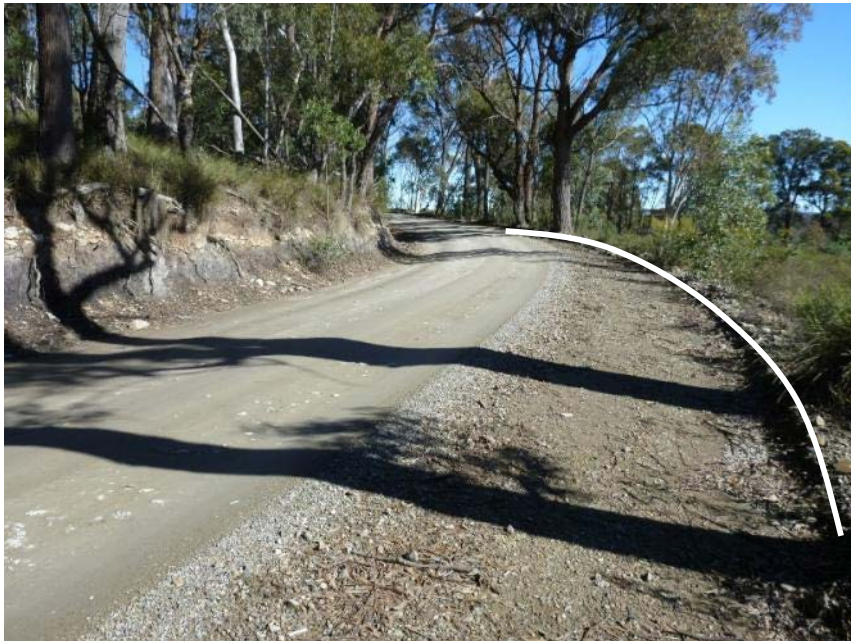
Plate 30 Location of Upgrade 3.16 ; looking 210°.

At this site it is proposed to fill the RHS corner (Plate 30). The site is on a moderate gradient simple slope. The area in which impacts would occur is excavated and highly disturbed by previous road works.