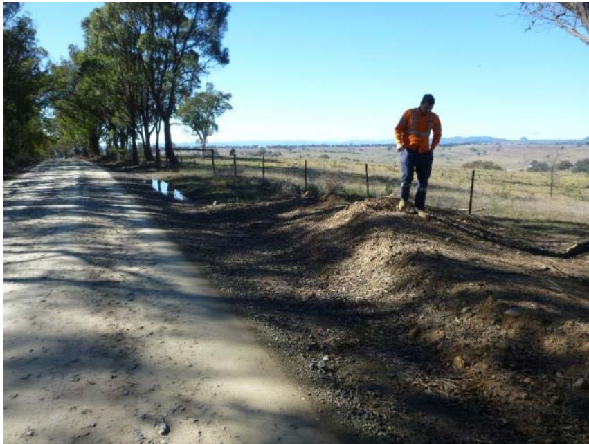
Plate 20 Location of PB15 ; looking 50°.

This site is on the LHS of the road on a narrow, very gently undulating ridge crest (Plate 20). The site is an existing area of cleared batter and graded gutter area measuring c. 30 x 4 m; it is highly disturbed. The site would require minor clearing and levelling.