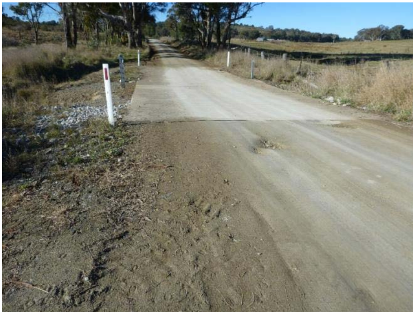
Plate 58 Location of Upgrade 3.29 ; looking 50°.

At this site some work may be required to the culvert (Plate 58). The site is on a drainage depression.