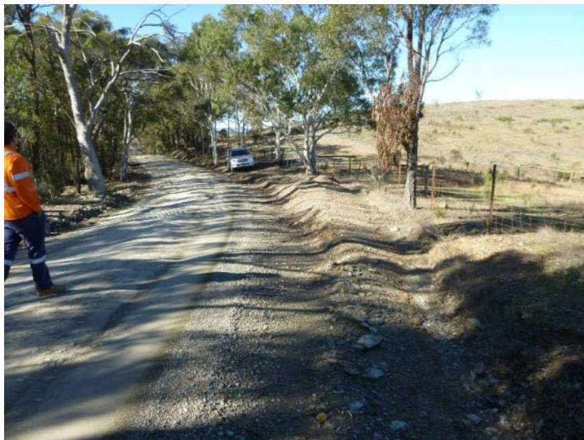
Plate 22 Location of PB16 ; looking 100°.

This site is on the LHS of the road on a narrow, very gently undulating ridge crest (Plate 20). The site is an existing area of cleared batter and graded gutter area measuring c. 25 x 3 m; it is highly disturbed. The site would require minor clearing and levelling.