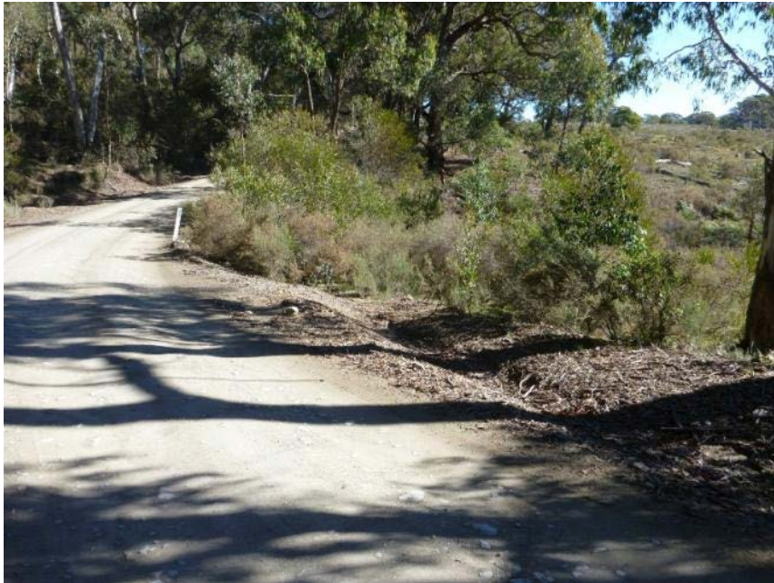
Plate 33 Location of Upgrade 3.17 ; looking 240°.

At this site it is proposed to remove trees/bushes and fill the RHS corner (Plate 33). The site is on a drainage line/simple slope. The area in which impacts would occur is excavated/filled and highly disturbed by previous road works.