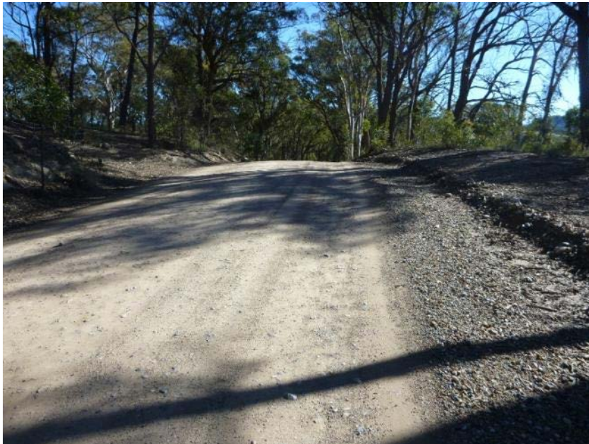
Plate 38 Location of Upgrade 3.21 ; looking east.

At this site it is proposed to modify (lower) the road (Plate 38). The site is on a summit of a gently undulating crest. The whole area in which impacts would occur is highly disturbed by previous road works.