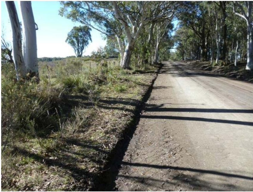
Plate 49 Location of PB33 ; looking 20°.