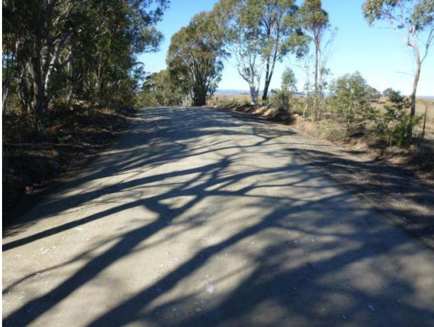
Plate 23 Location of Upgrade 3.12 ; looking 120°.

At this site it is proposed to modify the crest of the hill (Plate 23). The site is on a slight summit of a gently undulating ridge crest. The area in which impacts would occur is highly disturbed by previous road works.