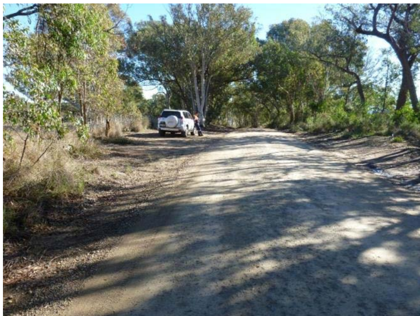
Plate 11 Location of PB08 ; looking 300°.

This site is on the LHS of the road on a slight summit of a very gently undulating ridge crest (Plate 11). The site is an existing area of graded gutter and road batter measuring c. 20 x 4 m; it is highly disturbed. Some clearing may be required.