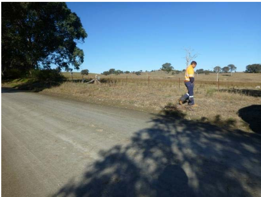
Plate 56 Location of PB38 ; looking 100°.

This site is on the LHS of the road on a very gentle simple slope (Plate 56). The site is an existing cleared and graded area measuring c. 40 x 4 m; it is highly disturbed. Some levelling would be required.