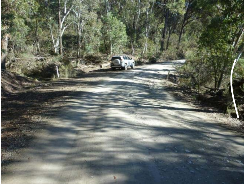
Plate 35 Location of Upgrade 3.19 ; looking 240°.