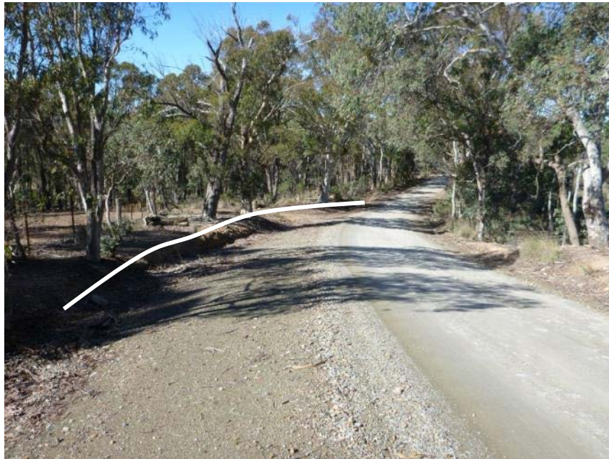
Plate 25 Location of Upgrade 3.13 ; looking 110°.

At this site it is proposed to fill the RHS corner to the edge of the vegetation (Plate 25). The site is on a slight summit of a gently undulating ridge crest. The area in which impacts would occur is highly disturbed by previous road works including an entrance to a property.