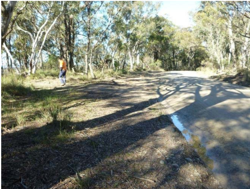
Plate 46 Location of PB30 ; looking 100°.

This site is on the RHS of the road on a slight summit of a very gently undulating ridge crest (Plate 46). The site is an existing area of cleared and graded area associated with a driveway measuring c. 30 x 8 m; it is highly disturbed.