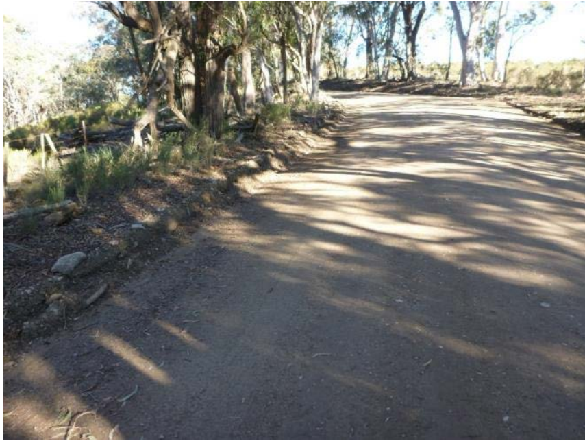
Plate 51 Location of Upgrade 3.25 ; looking south.

At this site it is proposed to fill and level the LHS corner (Plate 52). The site is on the break of slope of a gently undulating crest. The area in which impacts would occur is cleared and graded; it is highly disturbed.