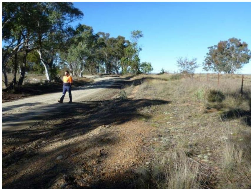
Plate 7 Location of PB06 ; looking 140°.

This site is on the LHS of the road just to the north of Upgrade 3.4. It is on a very gently undulating ridge crest (Plate 7). The site is an existing area of graded gutter and road batter measuring c. 50 x 6 m; it is highly disturbed. Some levelling would be required.