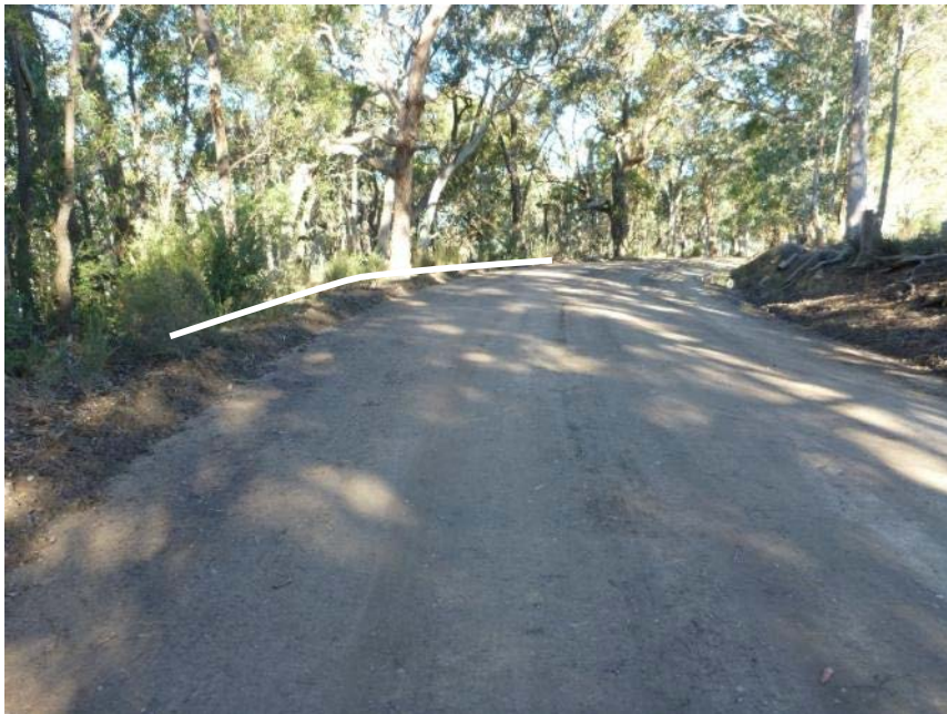
Plate 52 Location of Upgrade 3.26 ; looking 150°.

At this site it is proposed to fill and level the LHS corner (Plate 52). The site is on the break of slope of a gently undulating crest. The area in which impacts would occur is cleared and graded; it is highly disturbed.