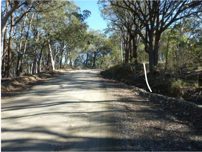
Plate 43 Location of Upgrade 3.23 ; looking 230°.