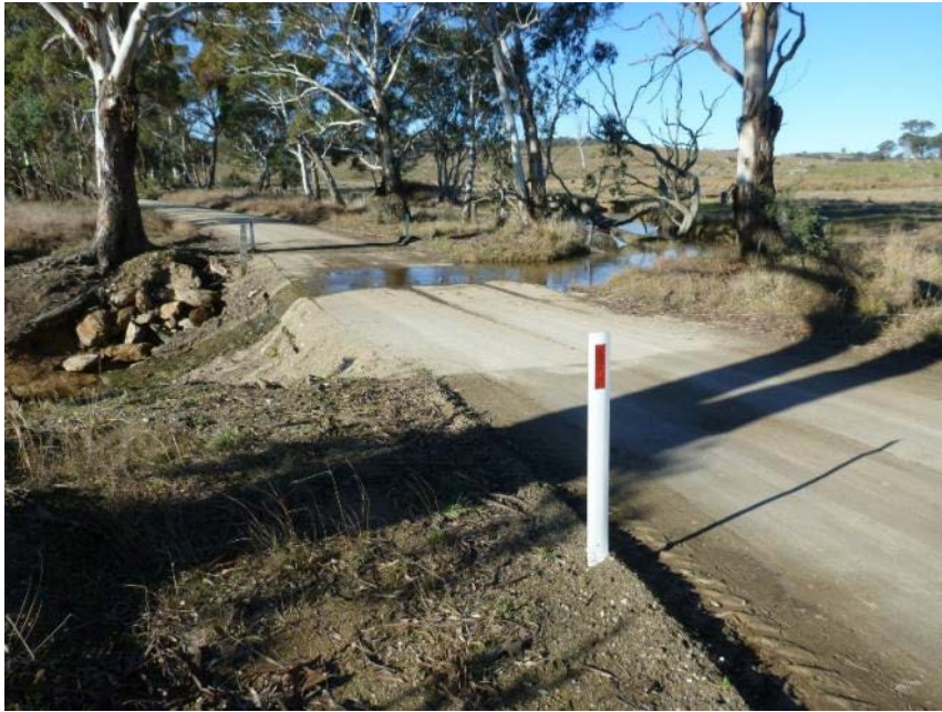
Plate 59 Location of Upgrade 3.30 ; looking 60°.

At this site the causeway requires replacement (Plate 59). The site is on a drainage depression.