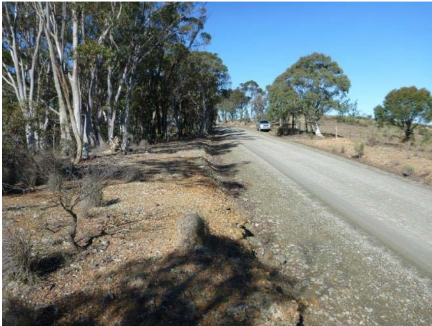
Plate 24 Location of PB17 ; looking 150°.

This site is on the RHS of the road on a narrow, very gently undulating ridge crest (Plate 20). The site is an existing area of cleared batter and graded gutter area measuring c. 30 x 4 m; it is highly disturbed. The site would require some levelling.