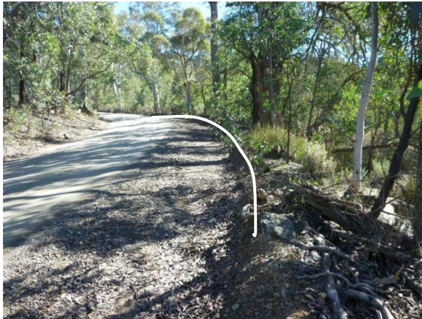
Plate 27 Location of Upgrade 3.14 ; looking 270°.

At this site it is proposed to fill the RHS corner and level the camber (Plate 27). The site is on a moderately undulating ridge crest. The area in which impacts would occur is highly disturbed by previous road works.