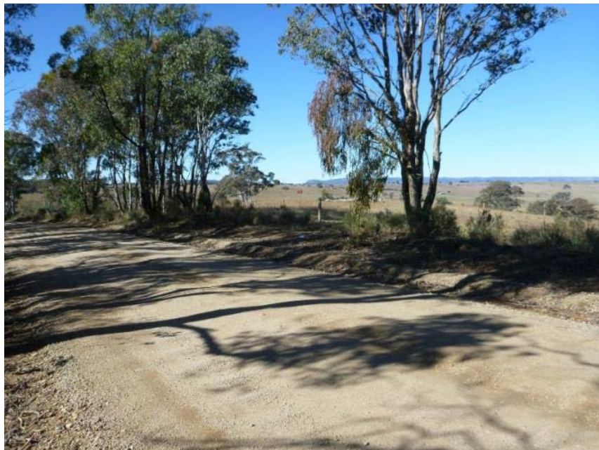
Plate 14 Location of PB10 ; looking 120°.

This site is on the LHS of the road on a slight summit of a narrow, very gently undulating ridge crest (Plate 14). The site is an existing area of graded gutter and road batter measuring c. 20 x 5 m; it is highly disturbed. The site would require some clearing and levelling.