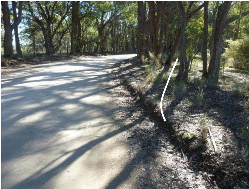
Plate 44 Location of Upgrade 3.24 ; looking 80°.

At this site it is proposed to remove c. fifteen trees on the RHS and level (Plate 44). The site is on a very gently undulating crest. The area in which impacts would occur is relatively undisturbed.