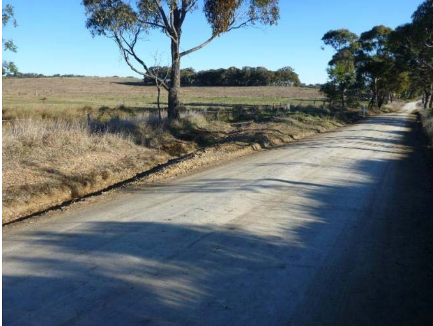
Plate 57 Location of PB40 (LHS); looking 190°.

This site is on either the LHS (Plate 57) or RHs of the road on a very gentle simple slope. The site is an existing cleared and graded area; both sides of the road are highly disturbed. Some levelling may be required.