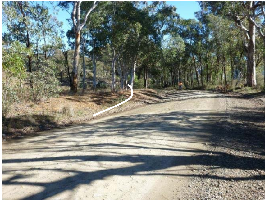
Plate 13 Location of Upgrade 3.9 ; looking 260°.

At this site it is proposed to remove c. five trees and level the inside (LHS) corner (Plate 13). The site is on a gently undulating ridge crest. The area in which impacts would occur is highly disturbed by previous road works.