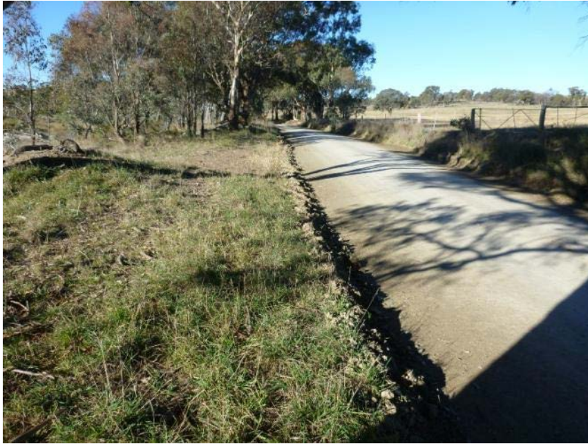
Plate 61 Location of PB42 ; looking 70°.

This site is on the RHS of the road on a flat (Plate 61). The site is an existing cleared and graded area; the area is highly disturbed. Some levelling may be required.