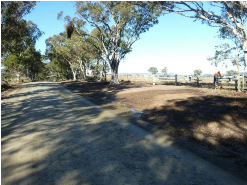
Plate 5 Location of PB05 ; looking south.

This site is on the LHS of the road at the entrance to a property. It is on a very gently undulating ridge crest (Plate 5). The site is an existing area of graded farm entrance and road batter measuring c. 40 x 10 m; it is highly disturbed.