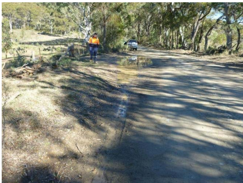
Plate 32 Location of PB23 ; looking 180°.

This site is on the LHS of the road on a narrow, very gently undulating ridge crest (Plate 32). The site is an existing area of cleared and graded gutter and batter area at a farm entrance measuring c. 20 x 4 m; it is highly disturbed. The site would require some clearance.