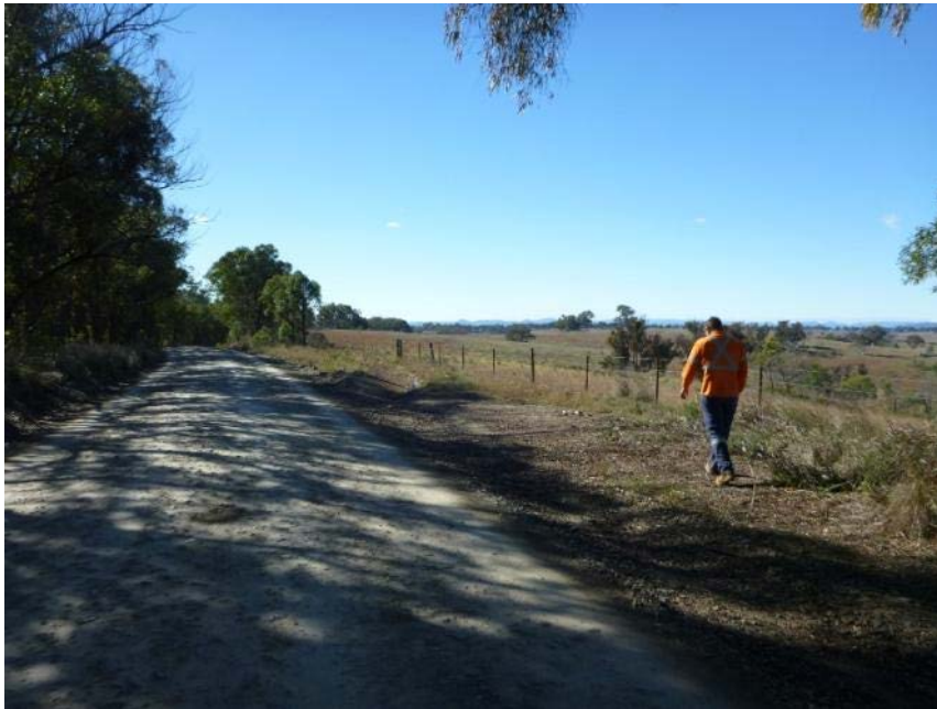
Plate 19 Location of PB14 ; looking 200°.

This site is on the LHS of the road on a narrow, very gently undulating ridge crest (Plate 19). The site is an existing area of cleared batter and graded gutter area measuring c. 30 x 4 m; it is highly disturbed. The site would require some clearing and levelling.