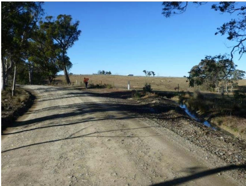
Plate 3 Location of PB03 ; looking 130°.

This site is on the LHS of the road on a narrow, very gently undulating ridge crest (Plate 3). The site is an existing area of graded clearing measuring c. 30 x 4 m. The entire area is a graded road batter and table drain; it is highly disturbed.