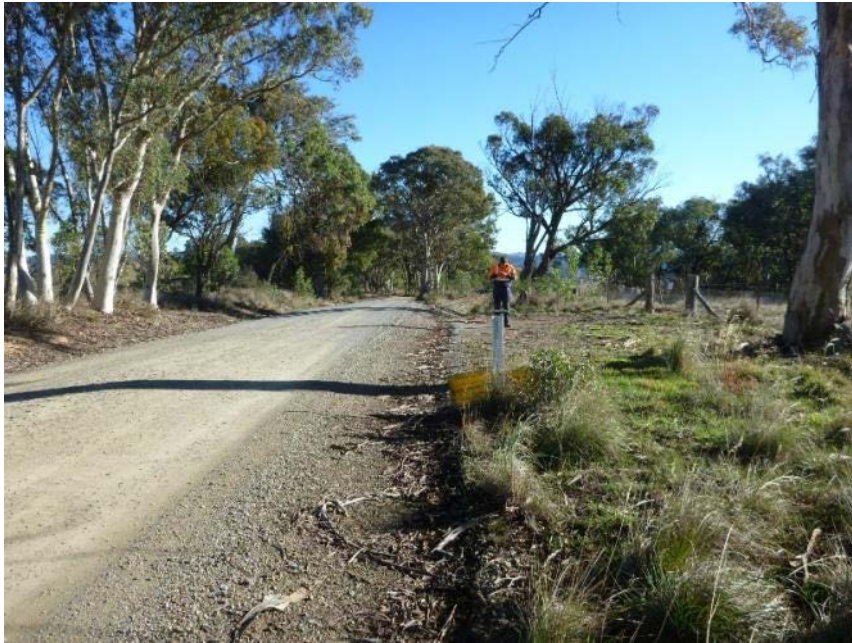
Plate 2 Location of PB02 ; looking 310°.

This site is on the LHS of the road on a narrow, very gently undulating ridge crest (Plate 3). The site is an existing area of graded clearing measuring c. 30 x 4 m. The entire area is a graded road batter and table drain; it is highly disturbed.