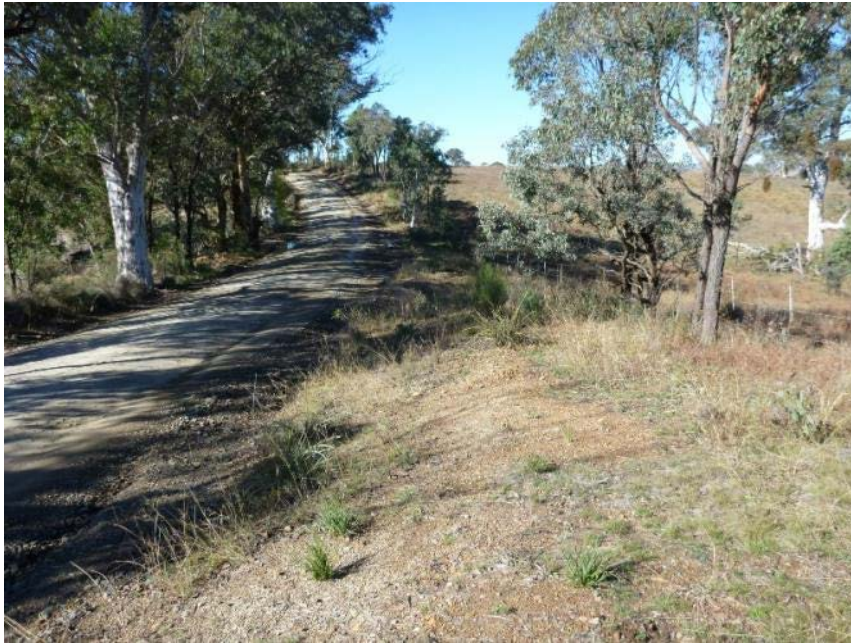
Plate 12 Location of PB09 ; looking 130°.

This site is on the LHS of the road on a slight saddle of a narrow, very gently undulating ridge crest (Plate 12). The site is an existing area of graded gutter and road batter measuring c. 25 x 5 m; it is highly disturbed. Some clearing would be required.