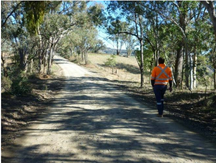
Plate 15 Location of PB11 ; looking 110°.

This site is on the RHS of the road on a slight saddle of a narrow, gently undulating ridge crest (Plate 15). The site is an existing area of clearing and graded gutter measuring c. 25 x 4 m; it is highly disturbed. The site would require minor clearing and levelling.