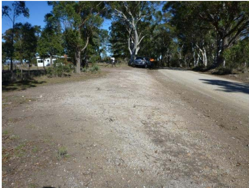
Plate 31 Location of PB21 ; looking 180°.

This site is on the LHS of the road on a wide, very gently undulating ridge crest (Plate 31). The site is an existing area of cleared and graded gutter and farm entrance area measuring c. 30 x 8 m; it is highly disturbed.