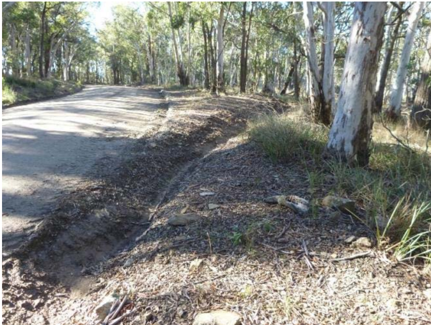
Plate 48 Location of PB32 ; looking 20°.

This site is on the LHS of the road on a gently undulating ridge crest (Plate 48). The site is an existing cleared and graded area measuring c. 25 x 4 m; it is highly disturbed. Some levelling would be required.