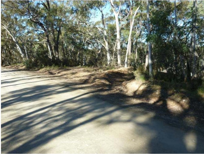
Plate 41 Location of PB28 ; looking 90°.