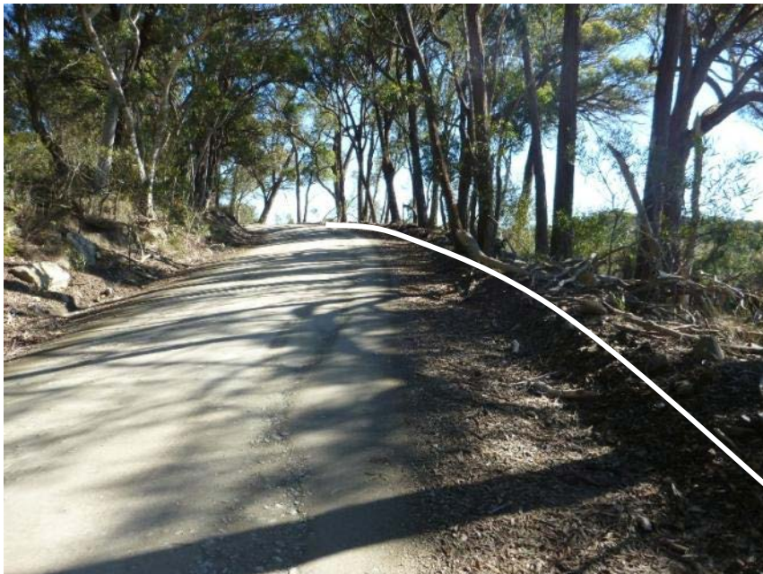
Plate 34 Location of Upgrade 3.18 ; looking 250°.

At this site it is proposed to fill and level the RHS corner (Plate 34). The site is on a simple slope. The area in which impacts would occur is benched and highly disturbed by previous road works.