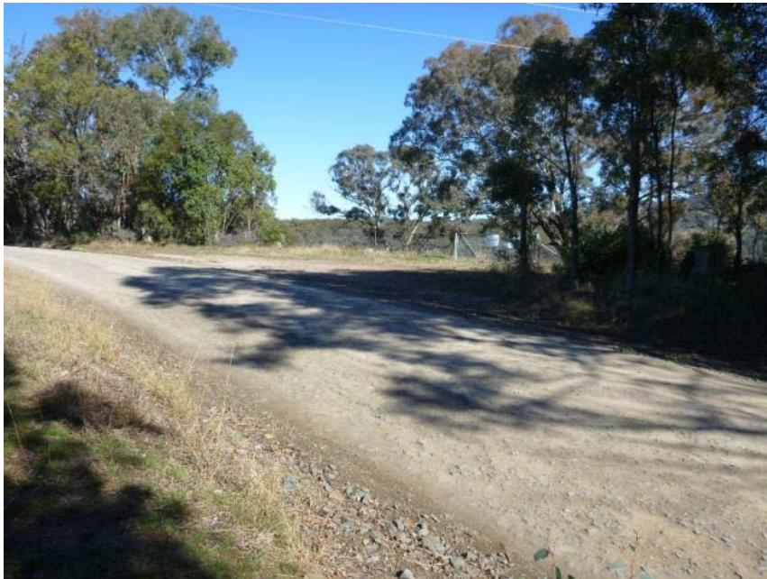
Plate 16 Location of PB12 ; looking 210°.

This site is on the RHS of the road on a slight summit of a very gently undulating ridge crest (Plate 16). The site is an existing area of clearing and farm entrance measuring c. 15 x 5 m; it is highly disturbed. The site would require minor clearing and levelling.