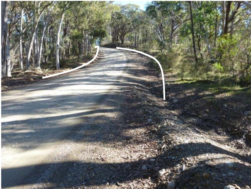
Plate 42 Location of Upgrade 3.22 ; looking 240°.

At this site it is proposed to level the RHS and fill to level the LHS (Plate 42). The site is on a moderately undulating crest. The area in which impacts would occur is highly disturbed by previous road works.