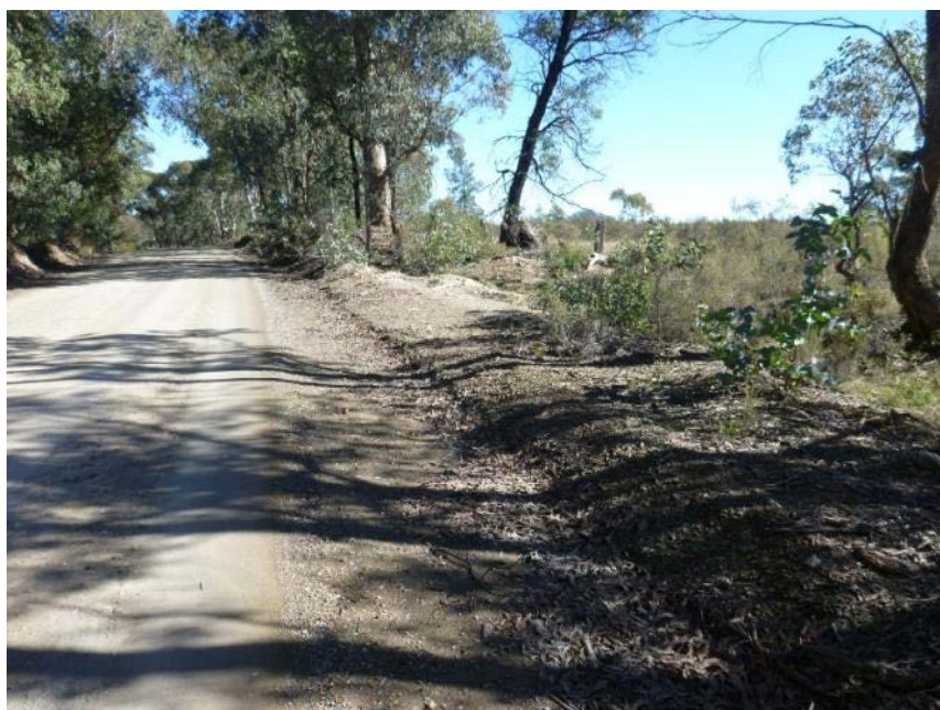
Plate 28 Location of PB19 ; looking 240°.

This site is on the RHS of the road on a slight summit of a very gently undulating ridge crest (Plate 28). The site is an existing area of cleared batter and graded gutter area measuring c. 20 x 5 m; it is highly disturbed. The site would require some clearance and levelling.