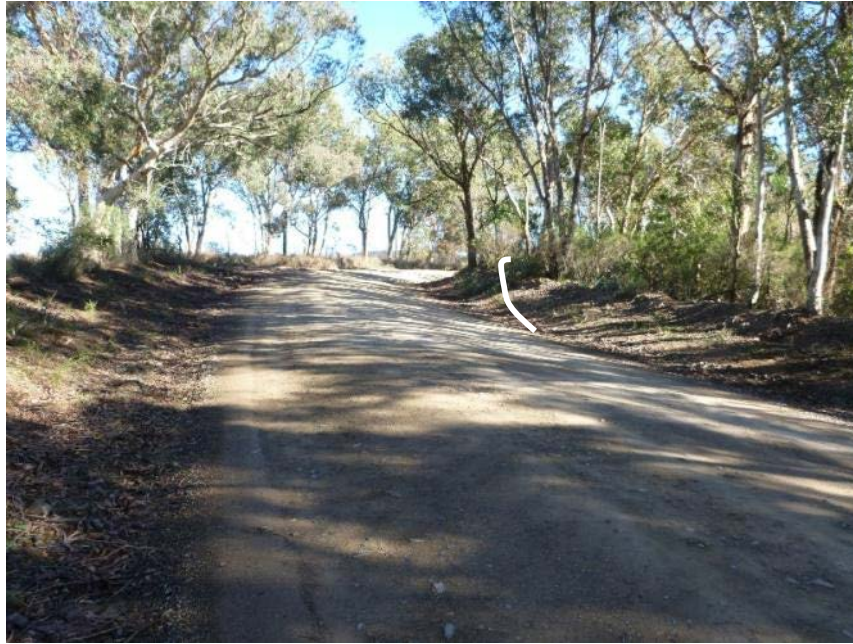
Plate 10 Location of Upgrade 3.7 ; looking 240°.

At this site it is proposed to remove two trees and level the corner on the RHS (Plate 10). The site is on a slight summit of very gently undulating ridge crest. The area in which impacts would occur is highly disturbed by previous road works.