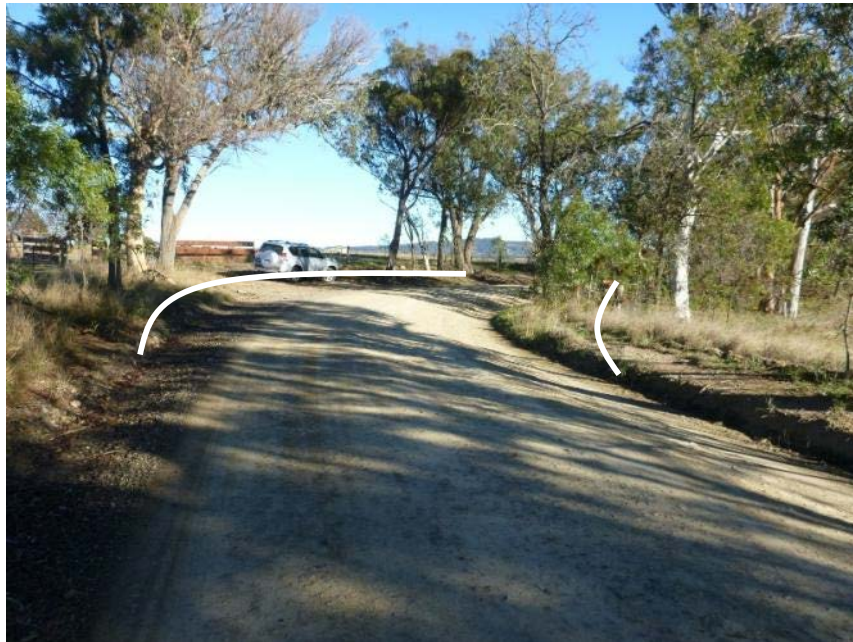
Plate 1 Location of Upgrade 3.3 and PB01 ; looking 270°.

At this site it is proposed to remove two trees and level the corner on both sides (Plate 1). The driveway at this location is also the site of PB01 (see further below). The site is on the break of slope of a narrow, slight summit of a very gently undulating ridge crest. The area in which impacts would occur is highly disturbed by previous road works.