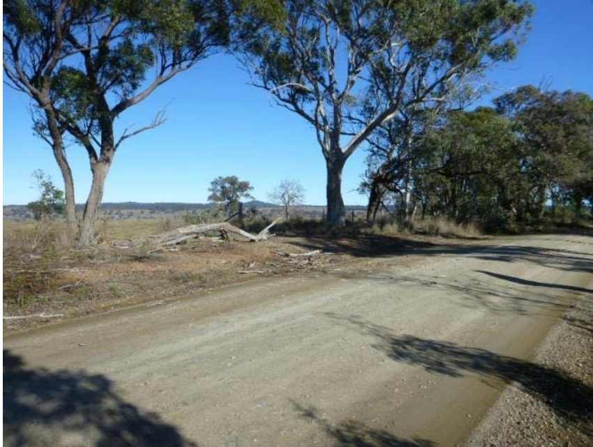
Plate 4 Location of PB04 ; looking 240°.

This site is on the LHS of the road on the slight summit of a narrow, very gently undulating ridge crest (Plate 4). The site is an existing area of graded clearing measuring c. 15 x 8 m. The entire area is a graded road batter; it is highly disturbed. Minor clearing would be required.