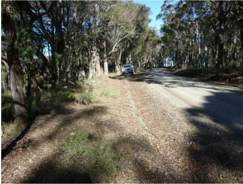
Plate 45 Location of PB29 ; looking 150°.

This site is on the RHS of the road on a slight summit of a very gently undulating ridge crest (Plate 46). The site is an existing area of cleared and graded area associated with a driveway measuring c. 30 x 8 m; it is highly disturbed.