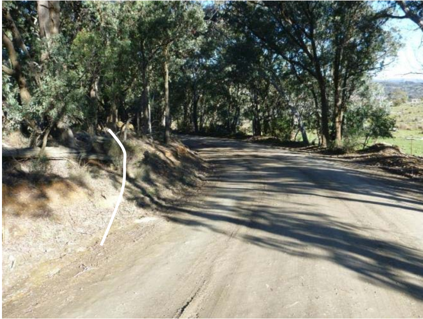
Plate 53 Location of Upgrade 3.27 ; looking 170°.

This site is on the LHS of the road on a simple slope. The site is an existing cleared and graded area measuring, c. 20 x 4 m; it is highly disturbed. Some clearing and levelling would be required.