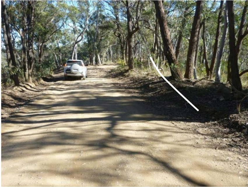
Plate 37 Location of Upgrade 3.20 ; looking 230°.