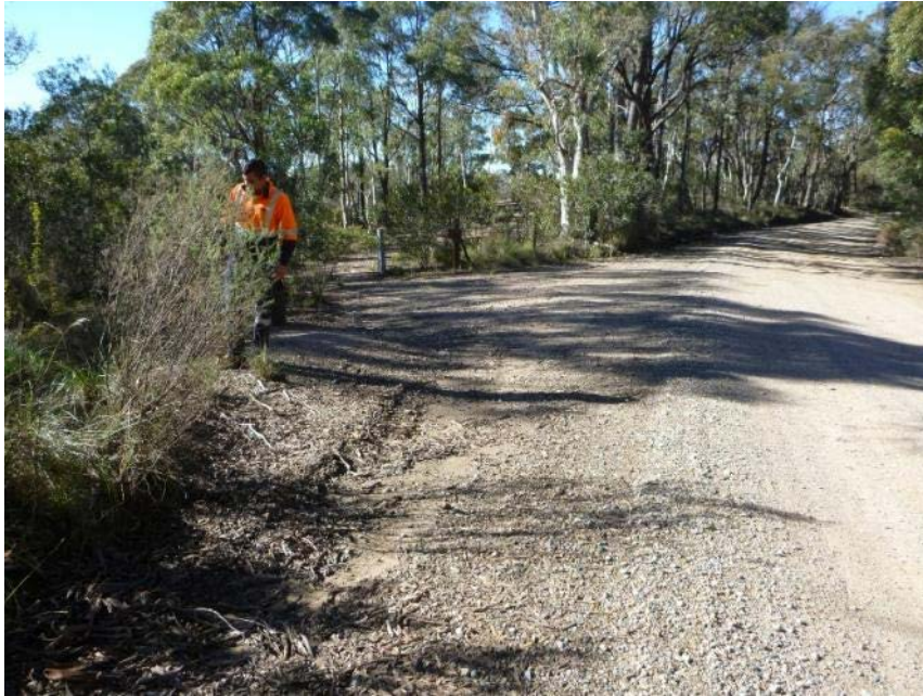
Plate 39 Location of PB26 ; looking 50°.

This site is on the LHS of the road on a very gently undulating ridge crest (Plate 39). The site is an existing area of cleared and graded gutter and property entrance measuring c. 25 x 5 m; it is highly disturbed.