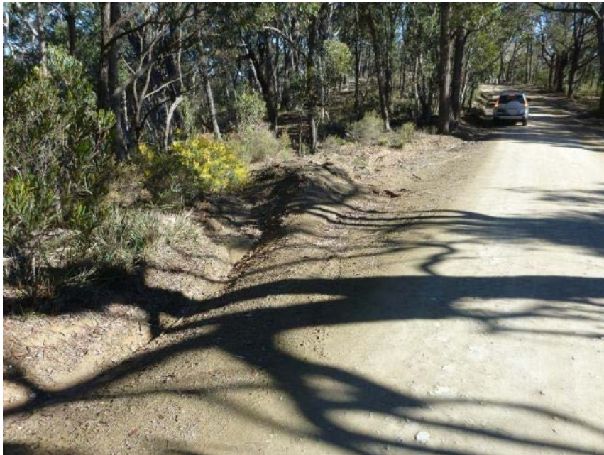
Plate 36 Location of PB24 ; looking 240°.

This site is on the LHS of the road in a slight saddle on a narrow, very gently undulating ridge crest (Plate 36). The site is an existing area of cleared and graded gutter and batter area measuring c. 20 x 3 m; it is highly disturbed. The site would require some clearance and levelling.