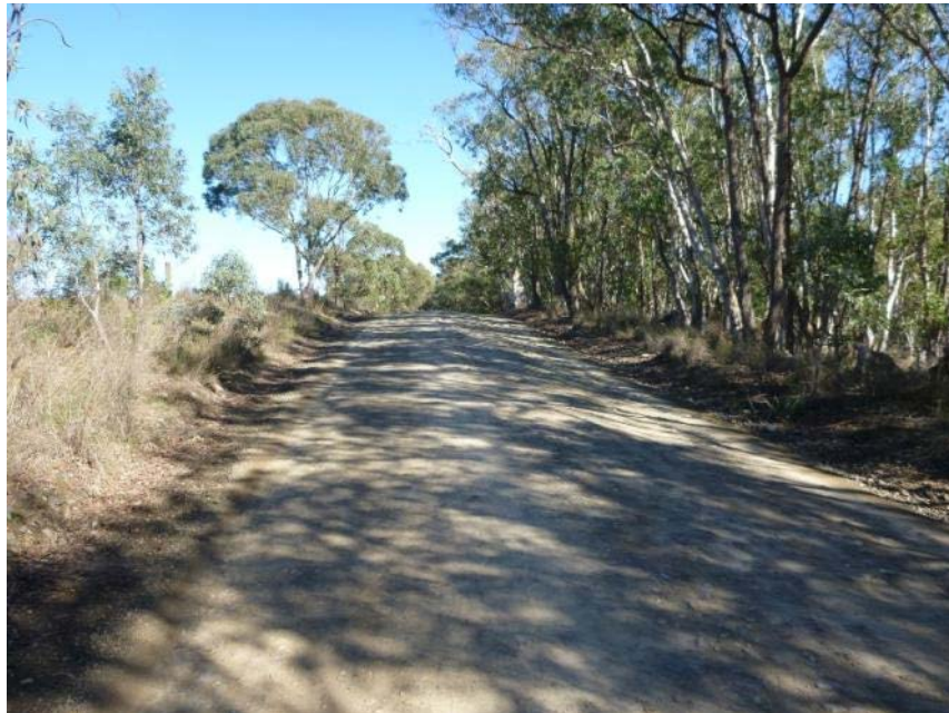
Plate 18 Location of Upgrade 3.10 ; looking 210°.

At this site it is proposed to modify (lower) the crest of the hill (Plate 18). The site is on a slight summit of a narrow, very gently undulating ridge crest. The area in which impacts would occur is highly disturbed by previous road works.