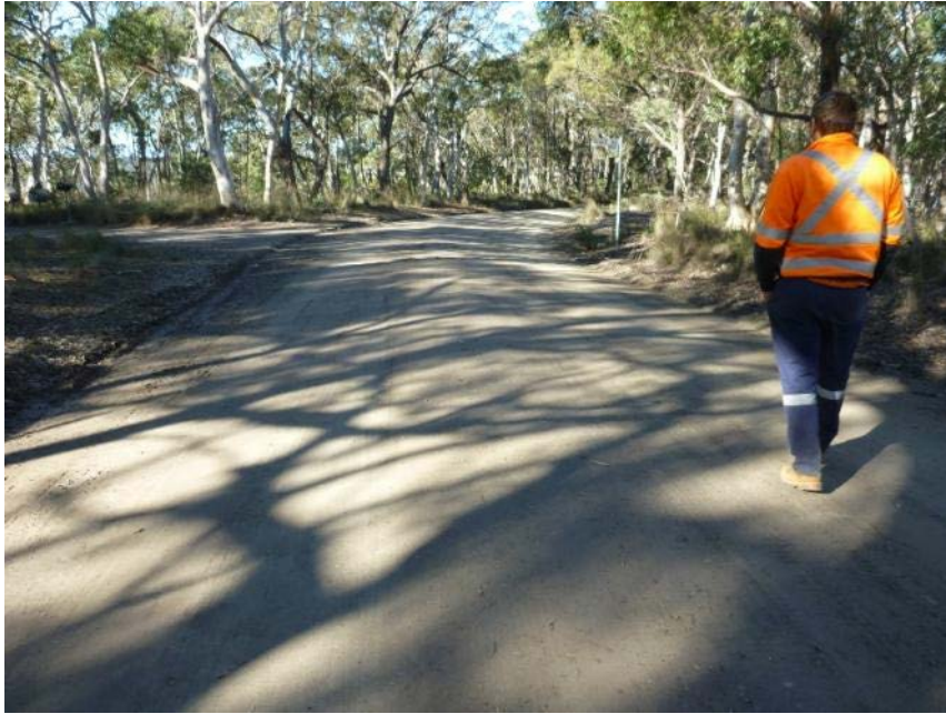
Plate 47 Location of PB31 ; looking 70°.