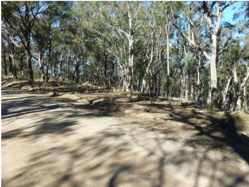
Plate 40 Location of PB27 ; looking 100°.

This site is on the LHS of the road on a narrow, very gently undulating ridge crest (Plate 40). The site is an existing area of cleared and graded gutter measuring c. 20 x 6 m; it is highly disturbed. Minor clearing and levelling would be required.