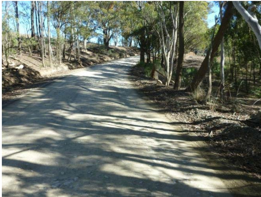
Plate 21 Location of Upgrade 3.11 ; looking 260°.

At this site it is proposed to remove c. five trees and fill and level the inside corner on the RHS (Plate 21). The site is on a break of slope of a gently undulating ridge crest and at the head of a drainage line. The area in which impacts would occur is highly disturbed by previous road works.