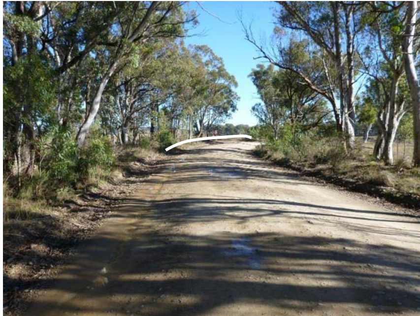
Plate 6 Location of Upgrade 3.4 ; looking 260°.

At this site it is proposed to fill and cut to widen on the LHS (Plate 6). The site is on a slight summit of a very gently undulating ridge crest. The area in which impacts would occur is highly disturbed by previous road works and the formation of a farm entrance. The majority of impacts would occur on an existing gutter, therefore previous impacts are high.