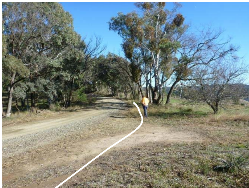
Plate 9 Location of Upgrade 3.5 and PB07 ; looking 255°.

This site is on the RHS of the road on a very gently undulating ridge crest (Plate 9). The site is an existing farm entrance and is highly disturbed. Minor clearing would be required.