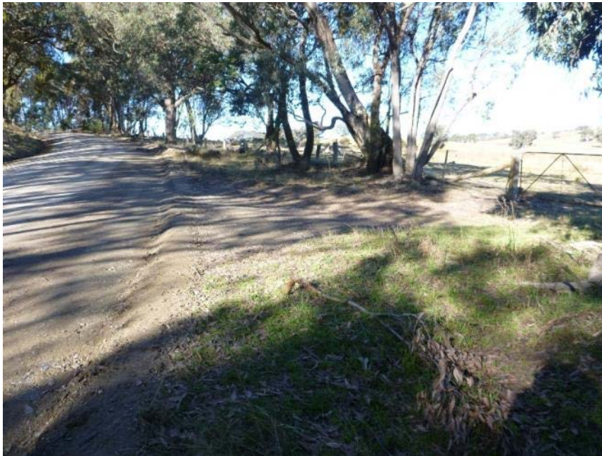
Plate 55 Location of PB37 ; looking 100°.

This site is on the LHS of the road on a gentle simple slope (Plate 55). The site is an existing cleared and graded area (property entrance) measuring c. 15 x 4 m; it is highly disturbed.