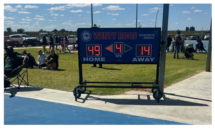
Gol Gol Wind Farm was proud to sponsor the purchase of an electronic scoreboard for the Wentworth District Football Netball Club

If you are interested in applying for sponsorship, please visit: <a href="https://www.squadronenergy.com/community/communitysponsorship">https://www.squadronenergy.com/community/communitysponsorship</a>