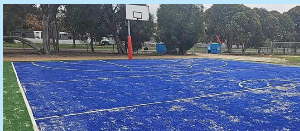
Skipton Primary School basketball court