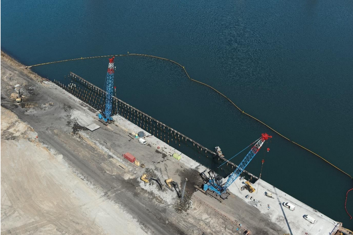
Photograph 1. View of MBD Site, showing berth 101 demolition in progress and silt curtain, facing west. Captured 31/08/2021.