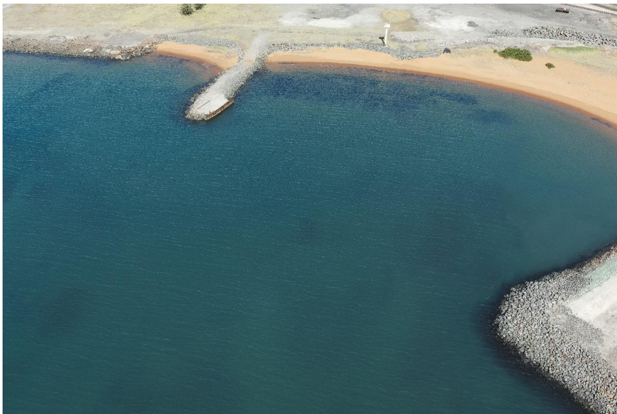
Photograph 3. View of outer harbour area prior to site setup. Captured 31/08/2021.