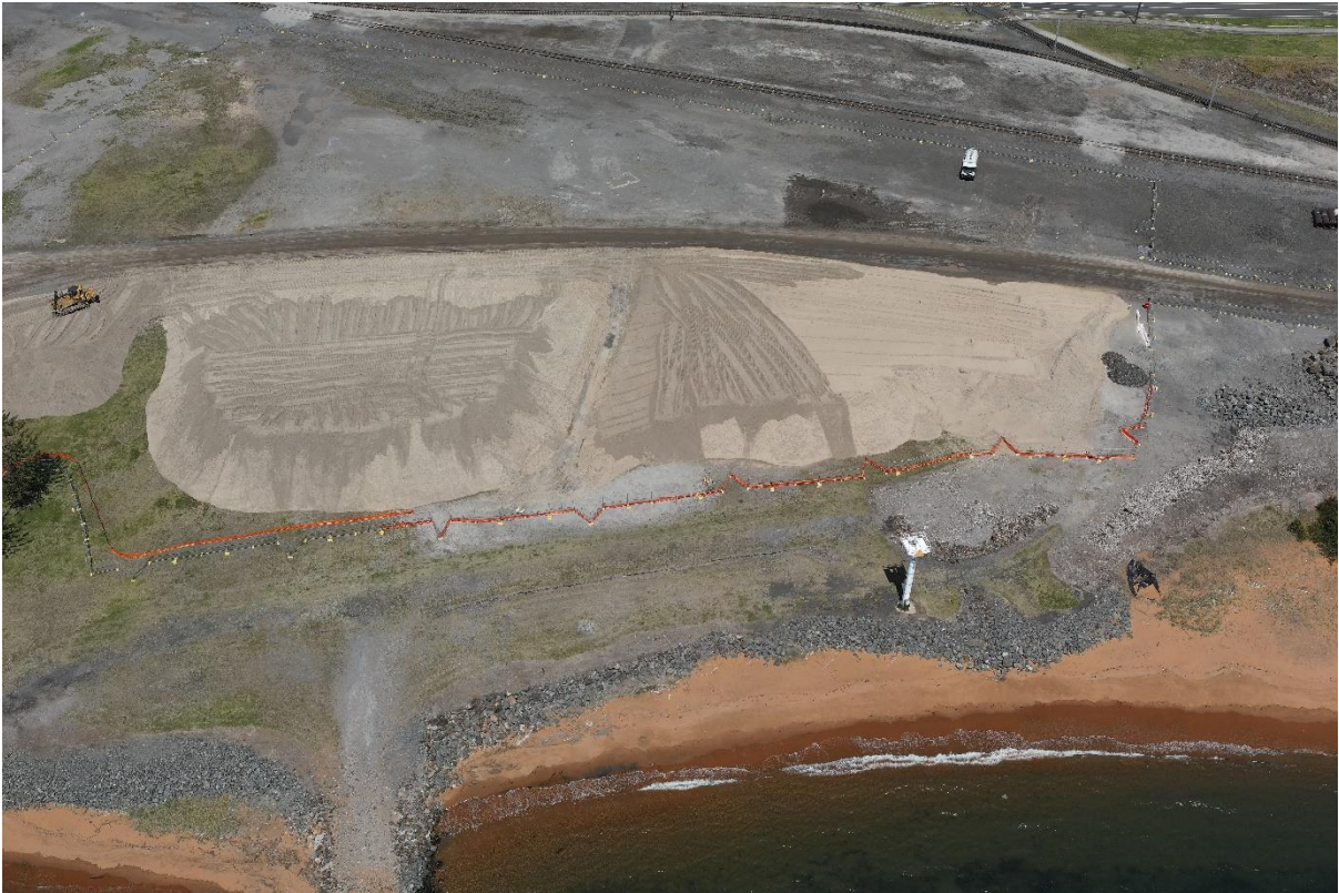
Photograph 1: View of Outer Harbour stockpiles and sediment controls.